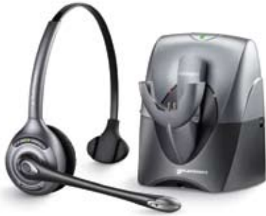
Plantronics SupraPlus Wireless Headset System

Until this study, sales reps conducted business using wired headsets attached by cords to their telephones.