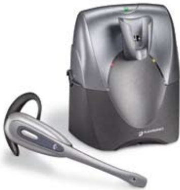
Plantronics CS55 Wireless Headset System

weeks with wireless headsets, to 2.1 a day after a month with headsets.