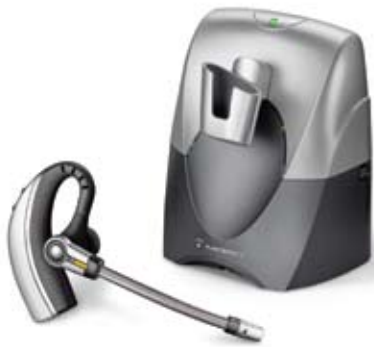
Plantronics CS70N Wireless Headset System

it? It meant mobility and freedom. Sales reps rated their ability to move around as the single most significant way their job improved from wearing the wireless headset. They were now free to move to a quiet corner; to a conference room – to anywhere they were most at ease conducting a sales call.