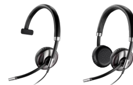
Blackwire 700 Series Wireless USB Corded Headset