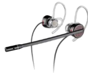
Blackwire 435 USB Corded Headset