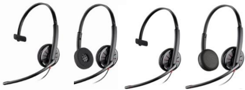
Blackwire 300 Series USB Corded Headset