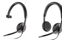
Blackwire 500 Series USB Corded Headset