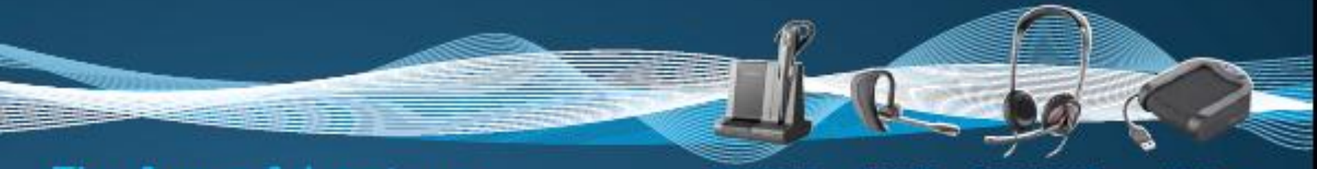
Office Wireless Bluetooth® Corded Headsets USB Phones

The Avaya Advantage for Unified Communications