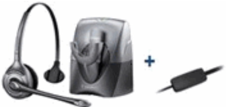
CS351N + APV-6A EHS Cable Combo Package Special