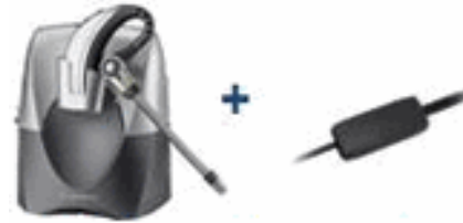
CS70N + APV-6A EHS Cable Combo Package Special