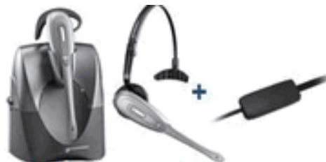
CS55 + APV-6B EHS Cable Combo Package Special