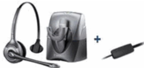
CS351N + APV-6B EHS Cable Combo Package Special