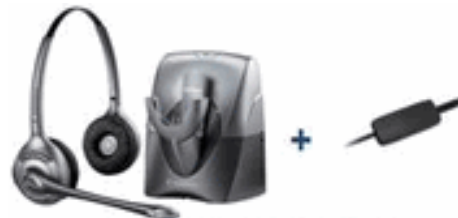
CS361N + APV-6A EHS Cable Combo Package Special