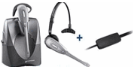
CS55 + APV-6A EHS Cable Combo Package Special